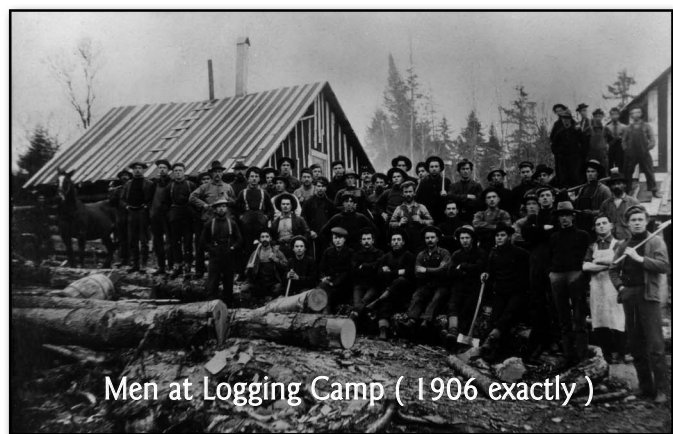
Men at Logging Camp (1906 exactly)

This image shows an unknown part of the state during the 1927 flood. The water appears to be flowing over a bridge or road that is lined with a guard rail. A line of utility poles follows the road on both sides. On the far shore of the river is a slope almost completely forested.